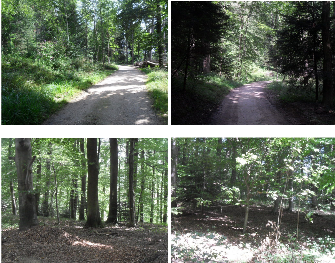
Figure 1-4, Views of the Nature Environment.

heavily forested so when on the nature trails, only natural elements are experienced; the woods are far enough away from any highways that no noise external to the woods can be heard (see Figures 1-4).